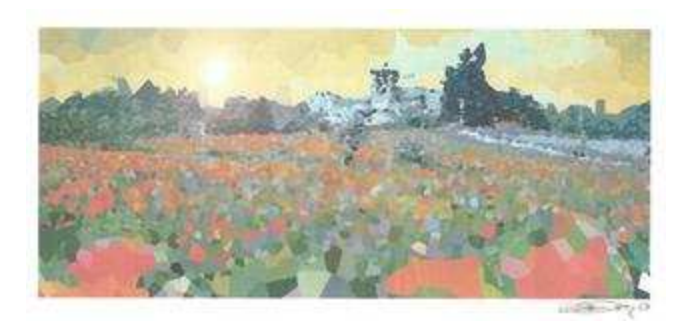
Two Minutes for Peace

Boxes for donations of new and gently used winter coats, books, and toys will be at various businesses, all schools and churches (St. Michael's has one!) in Barrington on November 7th through December 8th.