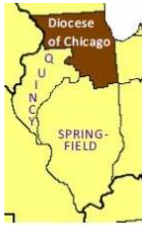
In 1877, the original Diocese of Illinois was divided into three separate dioceses.

Finally, on a totally personal scale, I was recently intrigued by an article about 'heart maps,' an art therapy practice of drawing what one loves and values within the traditional shape