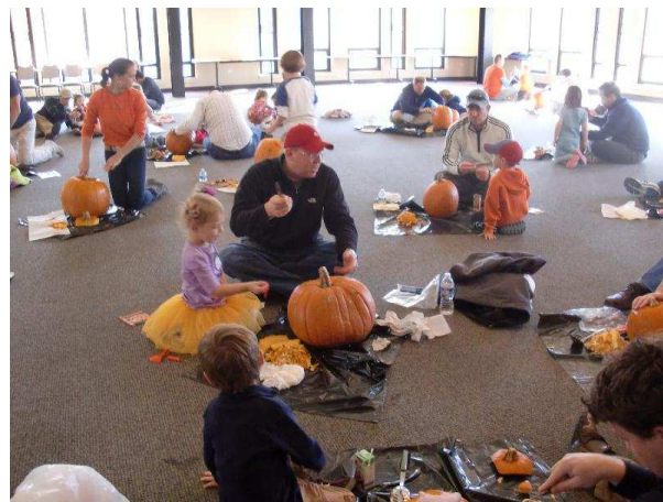
Dad's Day Pumpkin Carving