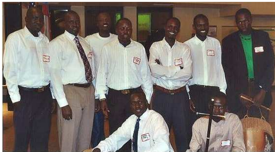
Lost Boys Choir Performed at African Eve 2011.

Don't forget to get your tickets for a night of fun, fellowship, and stewardship for a most worthy cause. On