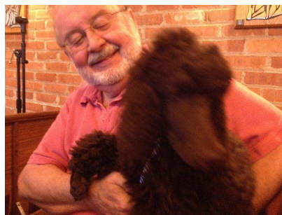
The Garbarek' standard poodle was blessed Thursday morning.