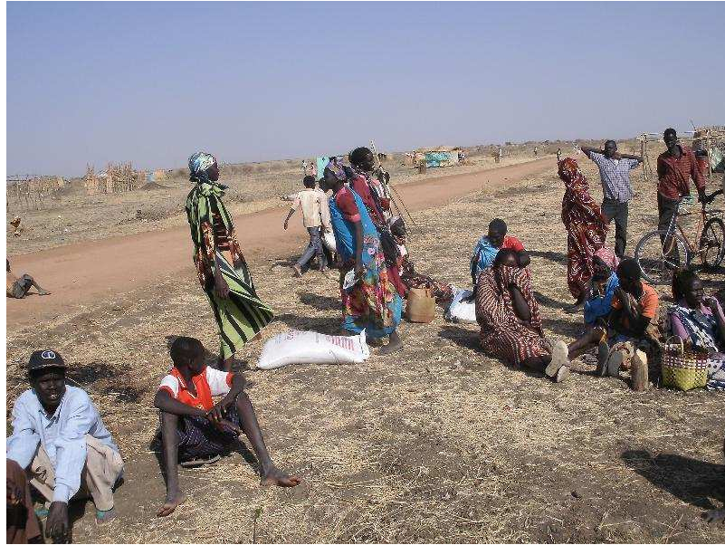
Refugees in Renk Town waiting for aid.