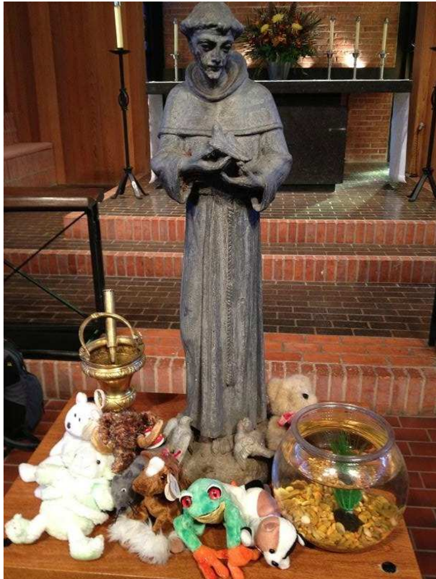
St. Michael's parishioners and Little Angels Preschool children gathered together on Thursday to have pets of all types - living and stuffed - blessed. Can you see the fish that was blessed?