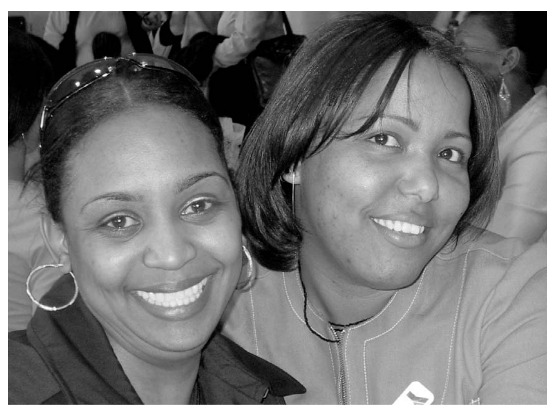
Greater Boston YMCA staff member with a parent.

The program's YMCA affiliation places it in a unique position to connect with a diverse group of families and community organizations. The program advertises workshops and events for parents offered by YMCAs in other locations. The program offers workshops for parents to support children's academics and refers parents who want or need such services to other resources beyond what the program provides.