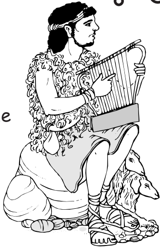
David, the Psalmist

Use the words around the thought bubble to write a praise psalm like David did.