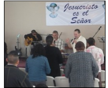
(Mike prophesying with an interpreter.)

Presently, more than 20 outreach churches are also experiencing the fires of revival due to Pastor Santiago's church influ-