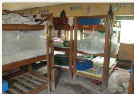
The construction of a new dorm is vital to the existence of the primary school.