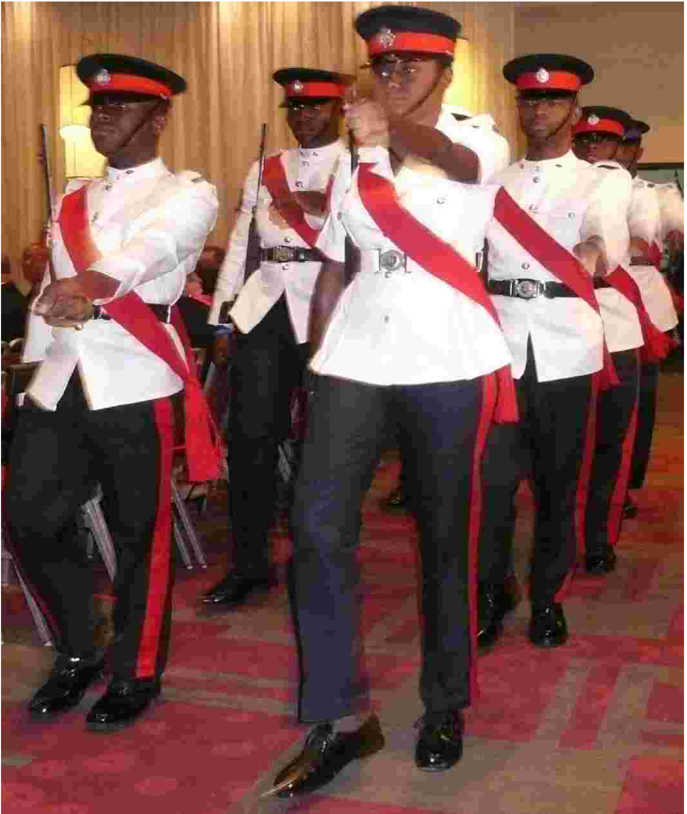
Jamaican Constabulary Force Honor Guard marching with extreme precision during the Memorial Service at the 38th Annual Training Seminar at Rose Hall Resort in Montego Bay, Jamaica.