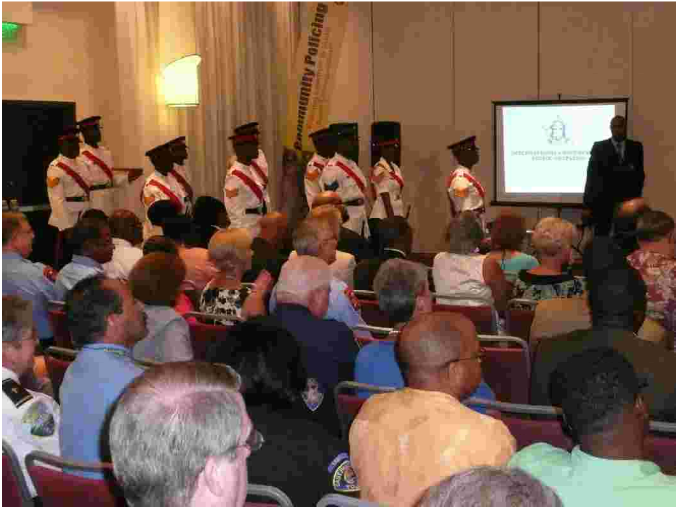
The Jamaica Constabulary Force Honor Guard marches in the formal opening ceremony of the 38th Annual Training Seminar at the Rose Hall Resort in Montego Bay, Jamaica.