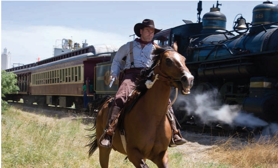
Enjoy the ride in an authentic Victorian-style coach from the early 1900s when you hop aboard Grapevine's Vintage Railroad for a unique experience riding the rails along the historic Cotton Belt Route between Downtown Grapevine and the Fort Worth Stockyards.