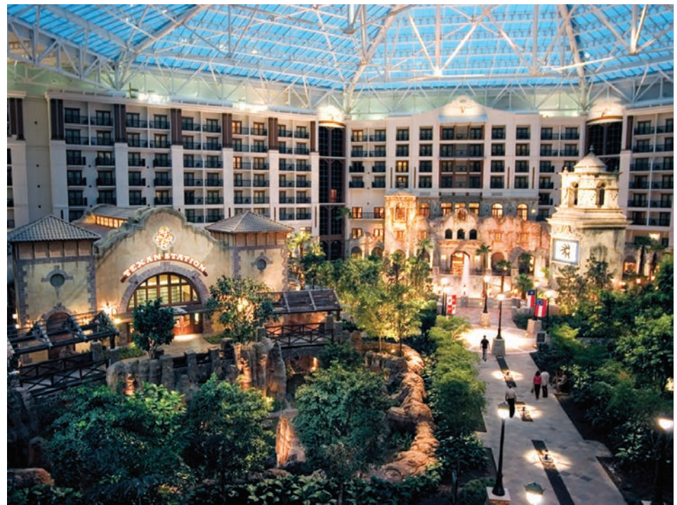
Beneath its signature glass atriums, the Gaylord Texan offers shopping, dining, entertainment and recreation options in 4.5 acres of indoor gardens and winding waterways.