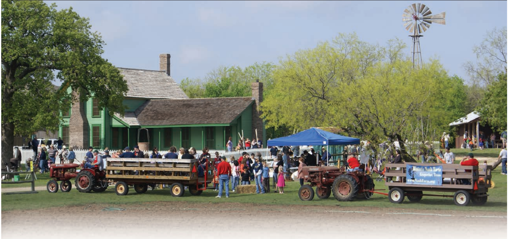
Step back in time and experience life on the farm and how Grapevine's earliest residents lived at Nash Farm, circa 1859, one of the oldest operating farmsteads in Tarrant County.

loss and grief as chaplains continue along the journey of healing and wholeness. Class size is limited to 30 chaplains.