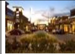
West End 2910 W Loop 289 Frontage Rd