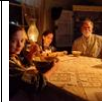
NATIONAL RANCHING HERITAGE CENTER

Fresh off a new addition and with over 160 windmills on display, this museum is one of the world's foremost centers of information on wind power.