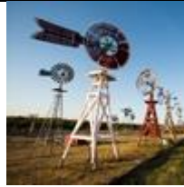
AMERICAN WIND POWER CENTER

Learn more about the fascinating history of World War II glider pilots at this museum, situated on the grounds of a former airfield. The focal point of the museum is a restored WACO CG-4A glider.