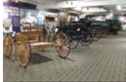
MUSEUM OF TEXAS TECH UNIVERSITY

Located on the Texas Tech campus, this museum focuses on the history of ranching; it features a collection of authentic homes, barns, schoolhouses, and other structures, which can be explored via a guided tour.