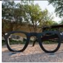
BUDDY HOLLY CENTER

1801 Crickets Ave (806) 775-3560 Distance from the hotel: 1.5 miles