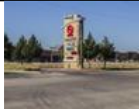
Canyon West 6076 US-62