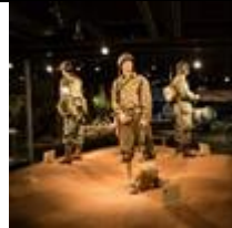
SILENT WINGS MUSEUM

Celebrate the life and legacy of musician and Lubbock native Buddy Holly at his namesake center, which also features an array of excellent contemporary art exhibitions.