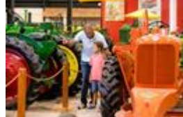
FIBERMAX CENTER FOR DISCOVERY

3301 4th St, Lubbock, TX 79415 (806) 742-2490 Distance from the hotel: 2.4 miles The Museum of Texas Tech University is a diverse and multifaceted cultural resource with six collecting divisions and 8.8 million objects.