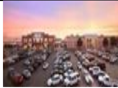
South Plains Mall 6002 Slide Rd