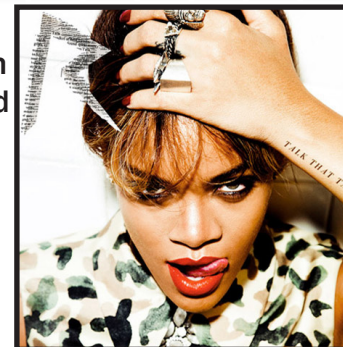
ARTIST: Rihanna ALBUM: Talk That Talk ADVICE: Avoid It!

It's impossible to reconcile, then, how Rihanna's stated faith relates to her NC-17 appetites. She says she wants to keep her eyes on God. Her album will take her fans' eyes off Him.