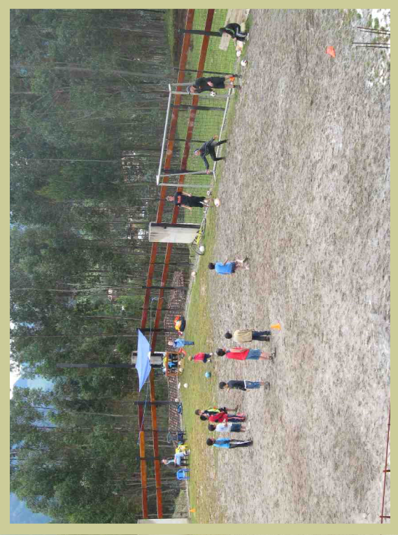
TOP RIGHT: Interns hosting summer soccer