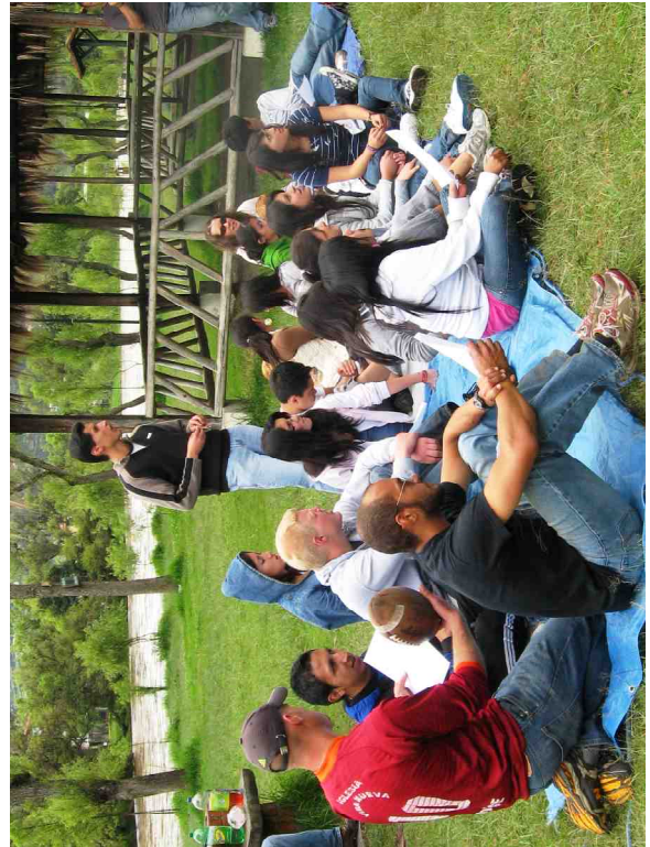
BOTTOM LEFT: Youth event with US and Ecuadorian youth.