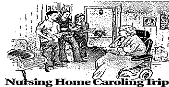
Nursing Home Caroling Trip

Friday Dec. 16 th 6:00p.m. (dress rehearsal)