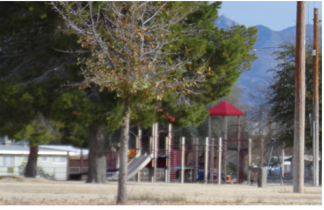
The Rising Star Evangelism Ministry has partnered with Tucson Clean and Beautiful to Adopt the Pueblo Gardens Park and neighboring railroad wash.