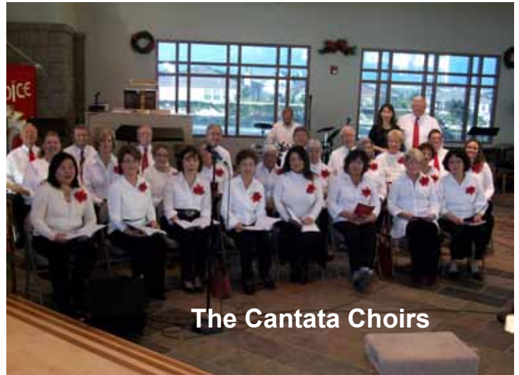
The Cantata Choirs