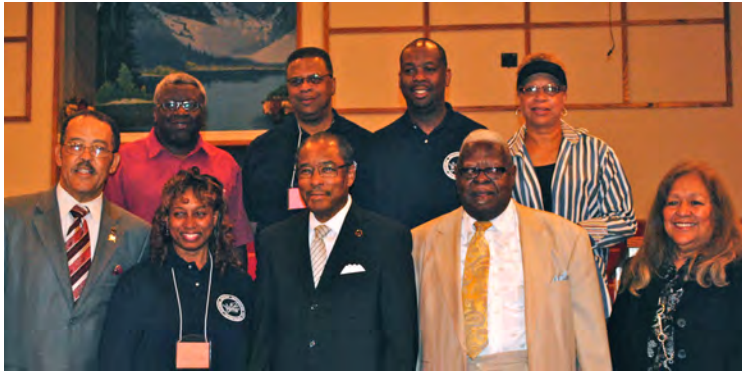
Press Conference Participants at June 20, 2011 Mission Day in Indianapolis