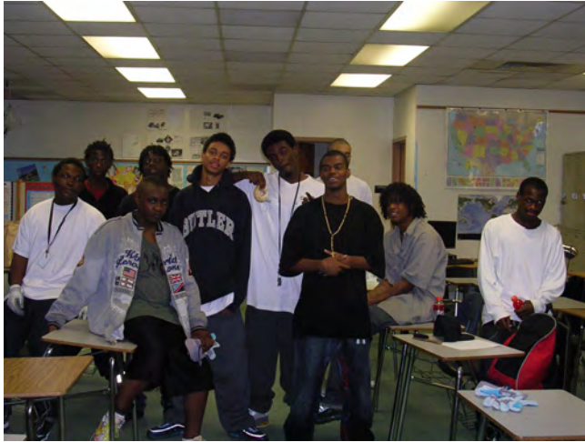
Youth from the Juvenile Detention Center Who Participated in the June 20, 2011 Mission Day in Indianapolis