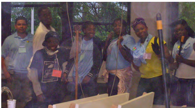
Workers at June 20, 2011 Mission Day