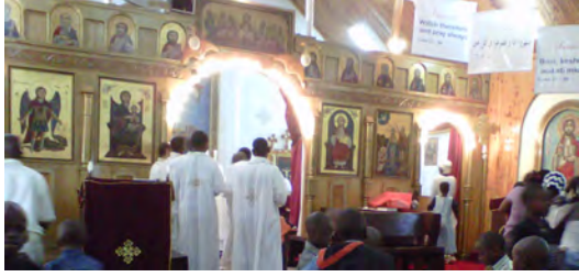
Coptic Orthodox Church in Nairobi, Kenya