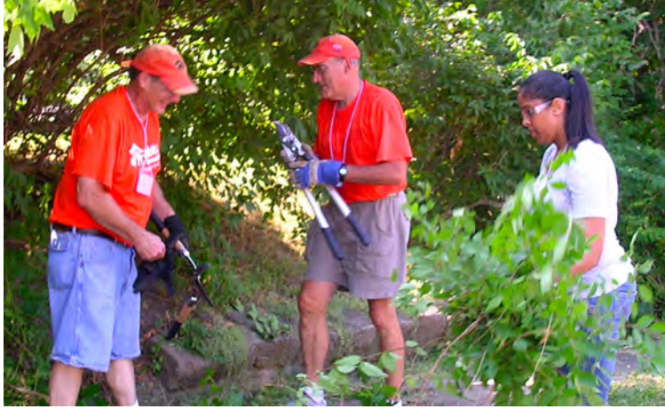
Habitat Tiger Team Members and a Martindale-Brightwood Leader