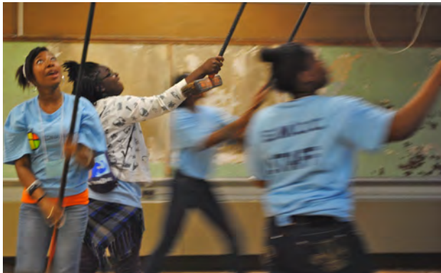
Youth Working on the Removal of Tiles at 37 Place on June 20, 2011