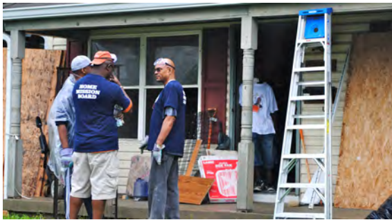
Some Home Mission Board Members Cleaning up a Home