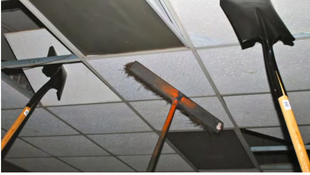
Tools at Work at the June 20, 2011 Mission Day