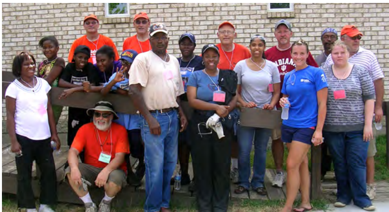
Some Workers from the July 23rd, 2011 Mission Day