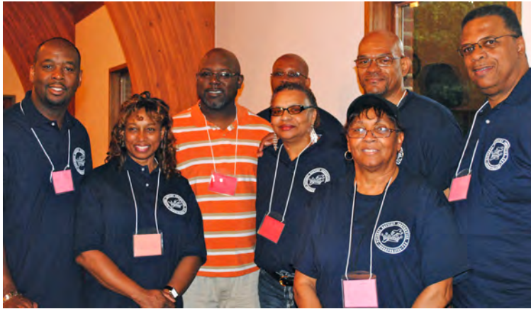
Home Mission Board Members at June 20, 2011 Mission Day in Indianapolis