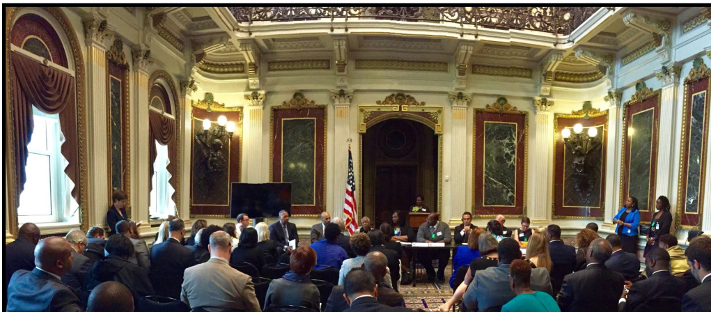
HUD CFBNP presents the "Community Partners Action Summit" to community stakeholders at the White House, one of several hundred "Capacity-Building and Grant-Writing Trainings" conducted nationwide during the Obama Administration.

While partnering with faith and community organizations to help their communities recover from the economic crisis was critical, long-term recovery depended on helping groups build capacity to better serve their communities. With this in mind, HUD CFBNP bolstered its signature "Capacity-Building and Grant Writing Training" for emerging non-profit organizations. Through the program, participants received personal instruction from HUD staff on how to become more competitive for Federal grants, secure 501(c)(3) status, and develop sound grant applications. The one- to two-day trainings also incorporated information from local funders and other subject experts to demystify the federal government grants process and build organizational capacity.