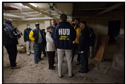
HUD’s Emergency Response Team inspects Hurricane Sandy damage.

Access to safe, decent and affordable housing represents an important foundation for sustainable livelihood, but housing becomes even more important in the wake of a natural disaster. When Hurricane Sandy struck the United States in 2013, HUD CFBNP swung into action. Center staff deployed to the hardest-hit areas to survey damage and convene roundtables of faith and community leaders to identify communities’ needs. In addition, HUD CFBNP worked with its sister center at the Federal Emergency Management Agency (FEMA) and participated in daily conference calls with faith, community and local government leaders in some of New York’s most damaged areas to track recovery progress and mobilize resources. In addition, HUD CFBNP updated its “Disaster Recovery Information Guide,” a booklet of Federal, state, local non-profit and philanthropic resources to help communities recover from disaster. More than 45,000 copies of the guide have been distributed to individuals and communities in New York and nationwide to help them prepare for, respond to and recover from disaster.