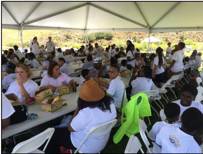
Hundreds of kids and volunteers came to the camp. Here they are eating lunch.