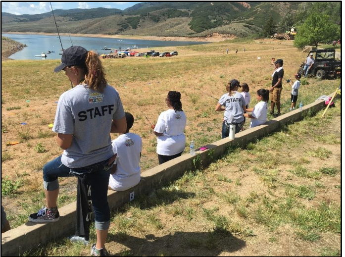
The kids had to cast out and try to hook toy fish.