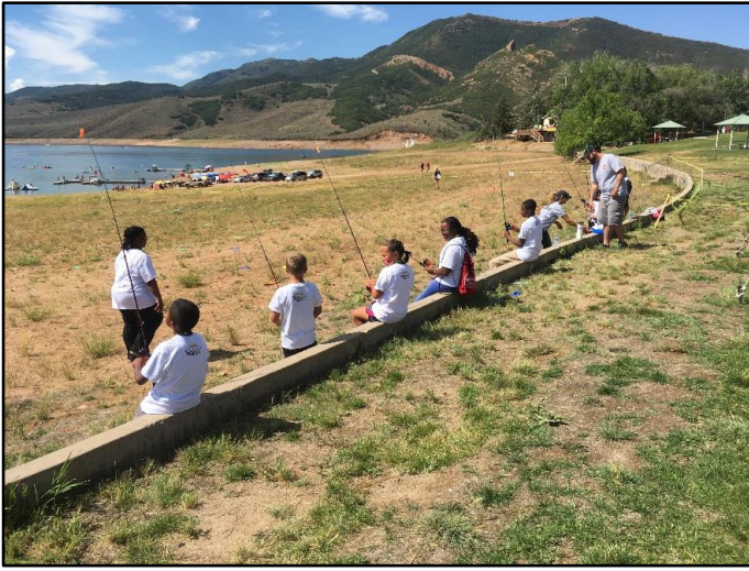
The kids learned how to cast a fishing pole while playing the game backyard bass.