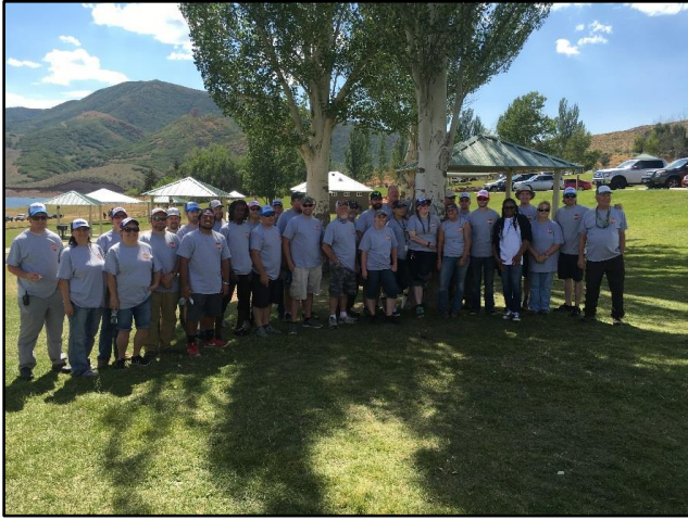
Cabela's Outfitters that helped run the camp. We had Outfitters from Cabela's in Lehi, Farmington and Tooele.