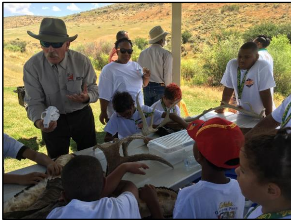
Phil even went into the anatomy of different animals and explained why their skulls have different shapes and why some animals have eyes on the sides of their heads.