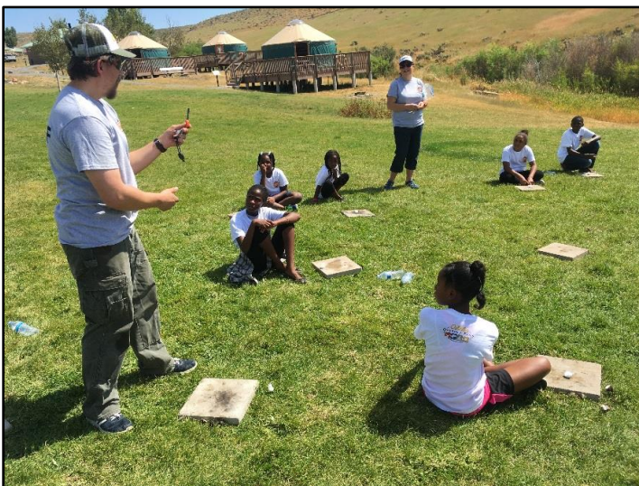
The kids learned how to start a campfire with flint and steel.