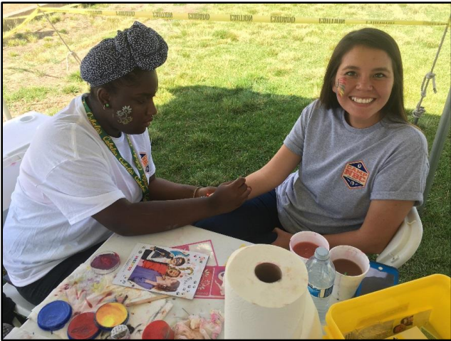
The volunteers also enjoyed getting their faces painted.