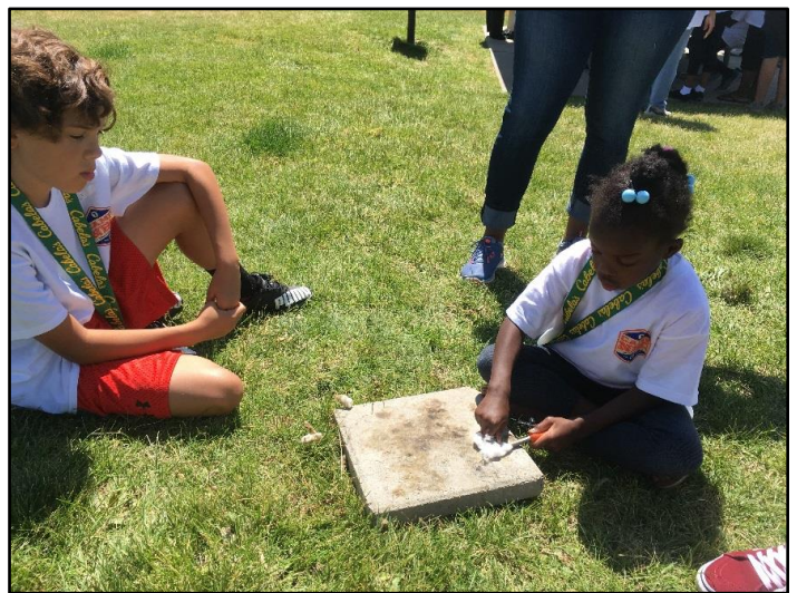
This little girl eventually started her own fire.