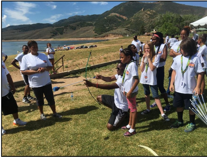
The kids learned how to shoot bows on the safe archery inflatable range.