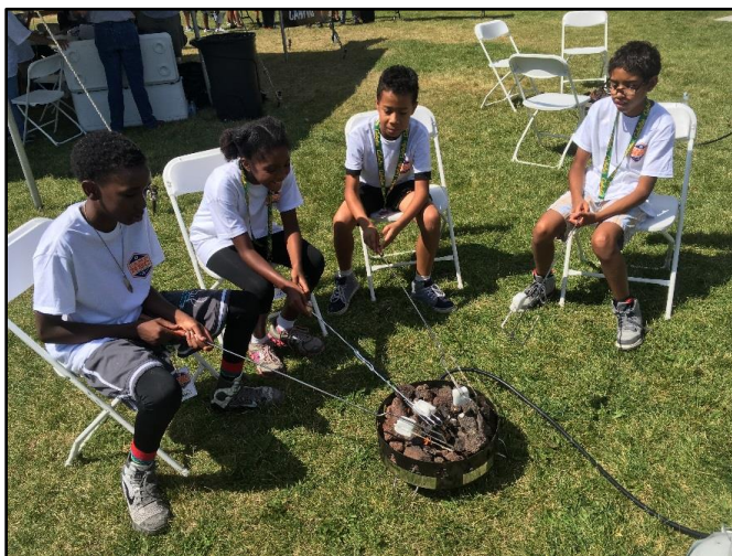
Some of these kids had never roasted a marshmallow nor eaten a s'more before.