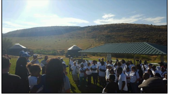
Baptist Church volunteers that helped run the camp.