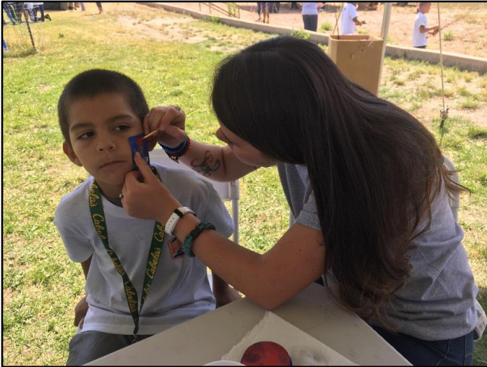
At the fishing station kids had fun getting their faces painted.