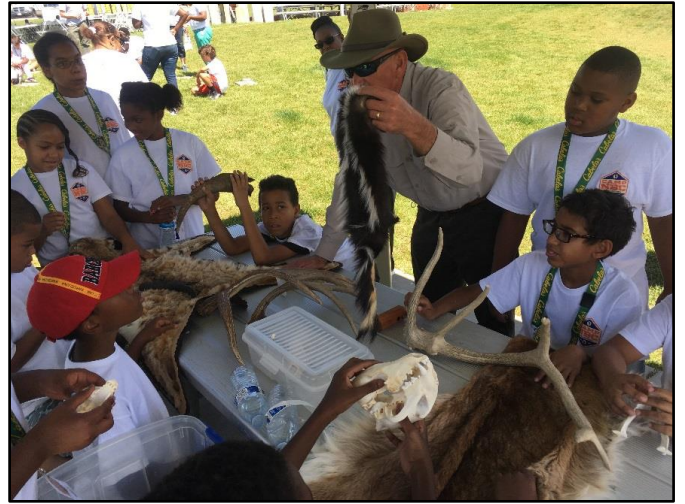
All the kids knew what a skunk was.