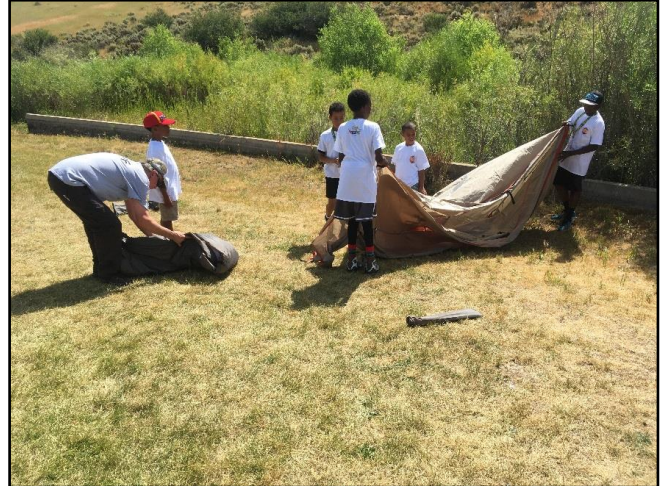
Kids learned how to set up and take down the tents.