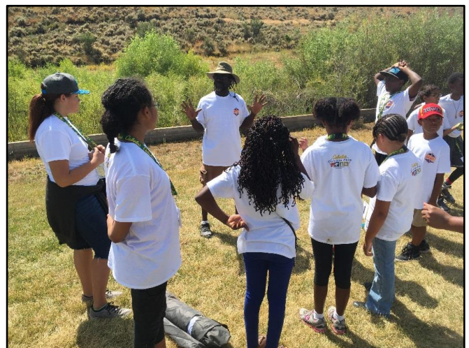
Here the kids learned from an avid camper about how fun camping can be.