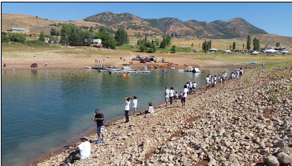
Here is one group of kids fishing the shoreline.