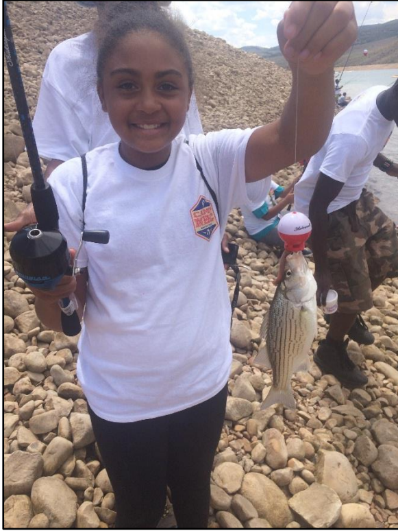
Fishing Station. The kids caught live fish. This girl caught a wiper.