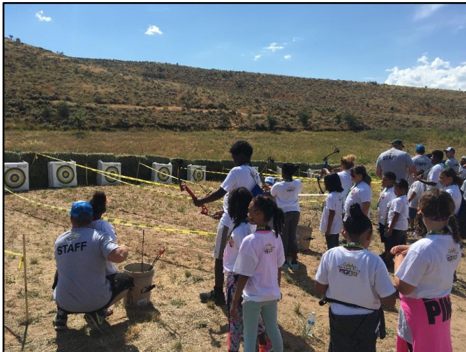
They then went to the real archery range where they shot real arrows at targets.