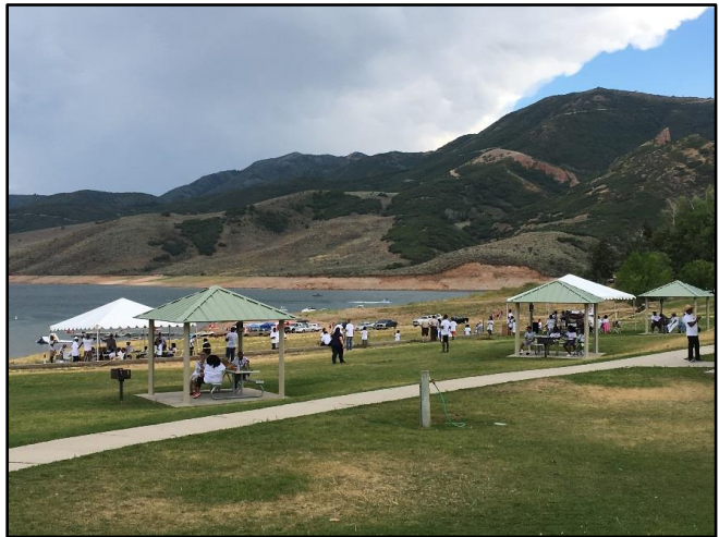
East Canyon State Park where we hosted the camp.