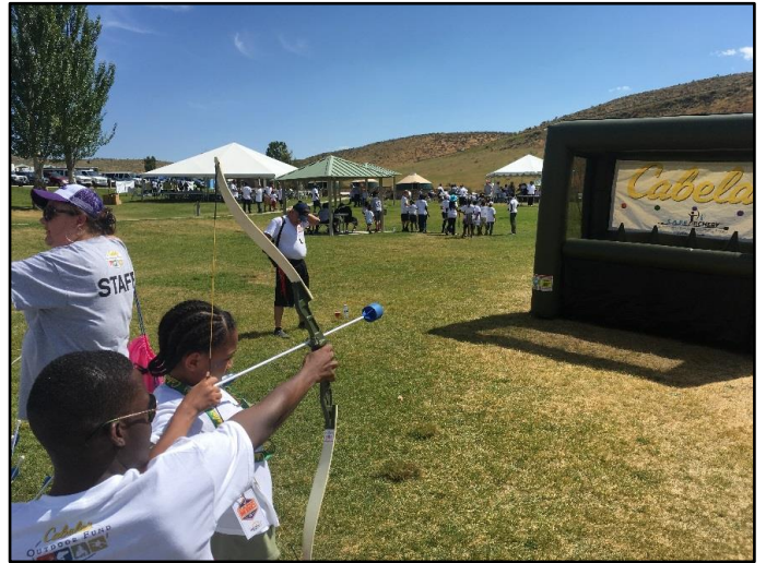
They learned how to hold a bow properly and aim.