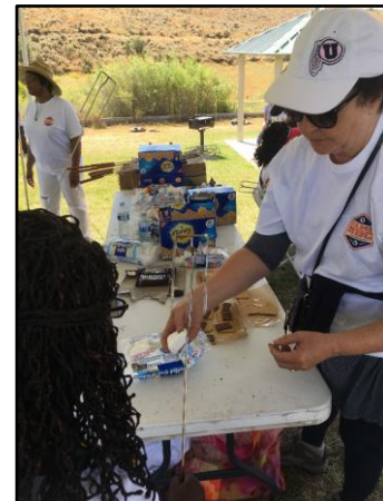
The kids were given the ingredients to make their own s'mores.