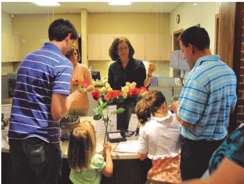
Flowers for Mother's Day benefited the Feed My Starving Children Event that is coming up in July.