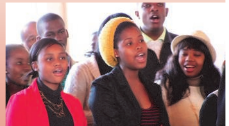
Upper left—Senior A Choir Bottom right—Youth Choir

hope to raise over $10,000. The Parish plans to build a church center alongside the current church, which would include a kitchen, cafeteria, toilets, and Sunday school classrooms. They need the center to provide space for all the different organizations that meet Sunday morning and throughout the week. They currently only have a small room and kitchen which are attached to the living quarters of their Pastor. We pray that they are successful in this fundraising effort.