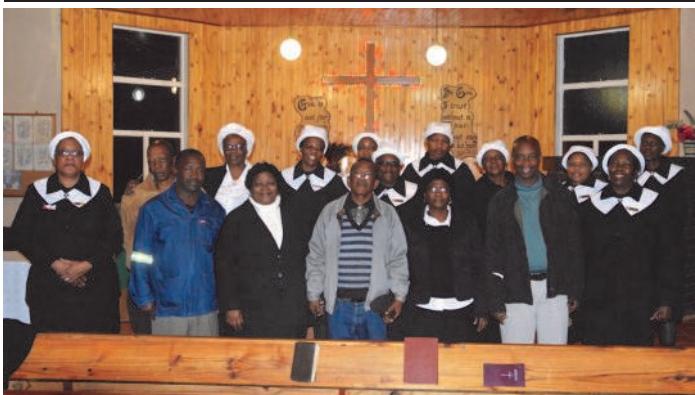
Kopano Lutheran Church Worship Services (cont. from Pg. 4)

We've come a long way from the original drawings and concepts of what PoP would and should look like. This is the original 1966 space.