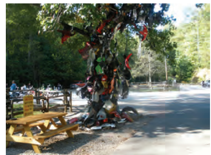
Tree of Shame – 9/28/10