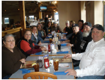
Dinner Ride – Brew Haus – Delafield – 5/8/10