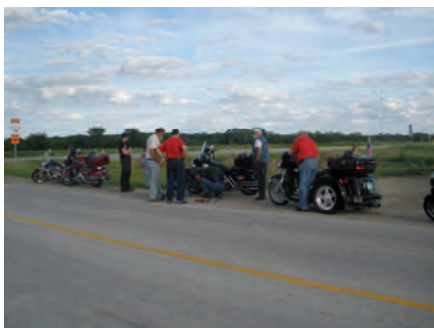
On The Road Maintenance – 6/19/10