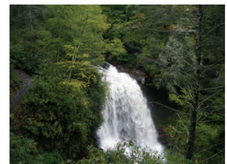
Mountain Falls – 9/27/10