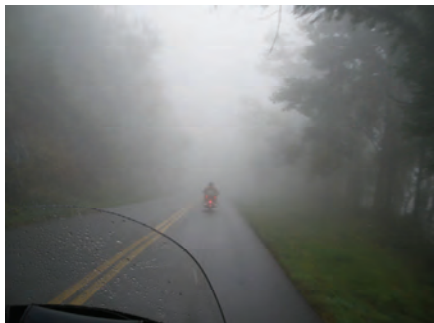
Foggy – 9/30/10