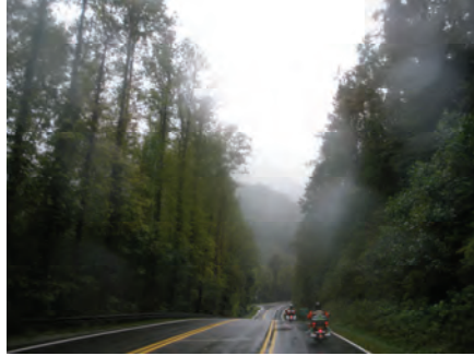
Drizzly Day – 9/27/10