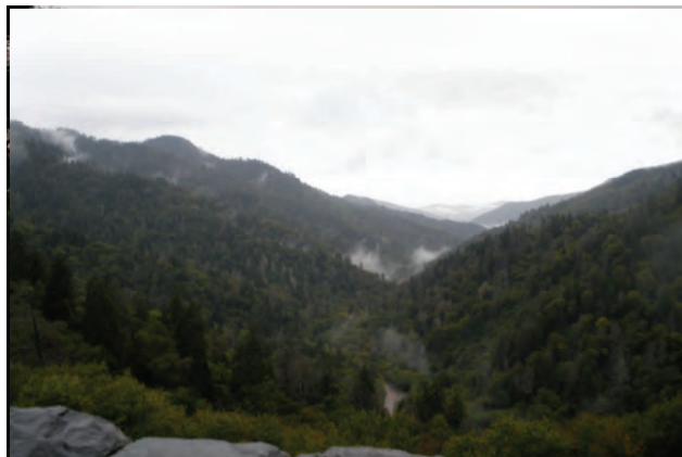
A beautiful view of the Smokey Mountains.

Praise God for a blessed riding season! Selah.