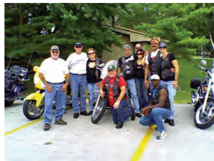
EAA Museum Trip – 8/7/10