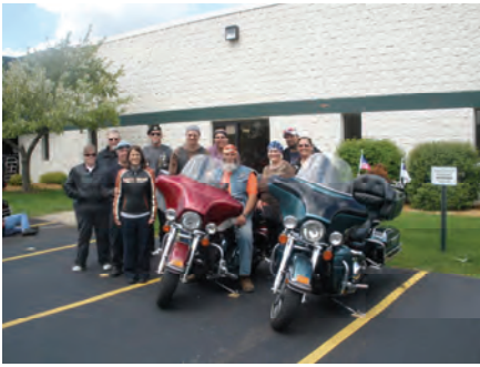
Biker Blessing with CMA – 5/2/10