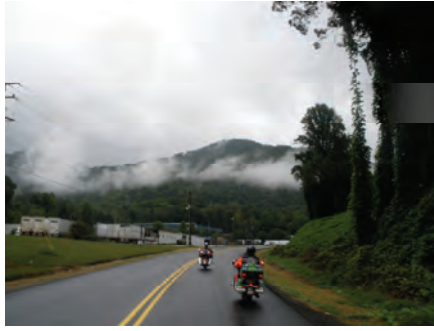
On To The Dragon's Tail – 9/27/10