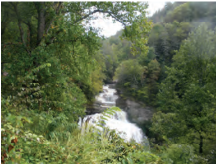
Mountain Stream – 9/27/10