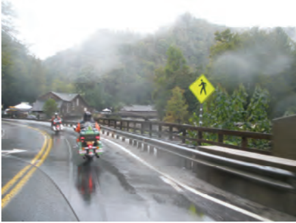
Rainy Riding – 9/27/10