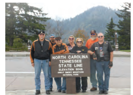
Magnificent 7 – 9/29/10