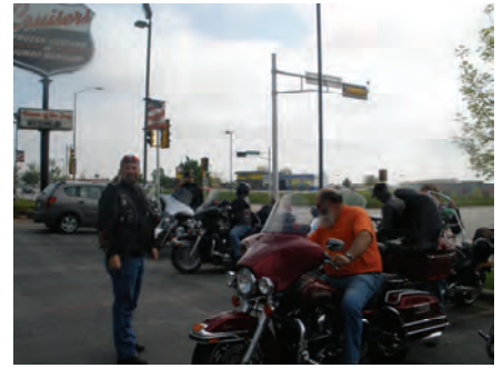
Sheboygan HD – 5/22/10