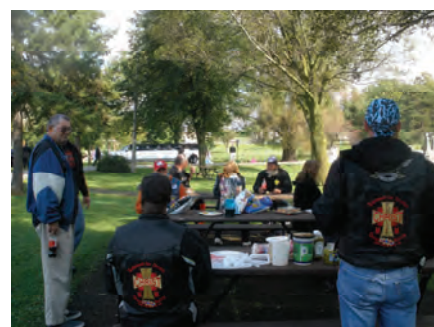
Picnic at Hartford Park – 9/11/10