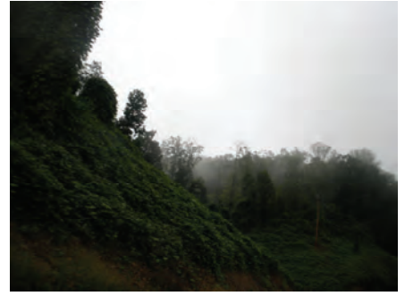
The Smokies – 9/27/10