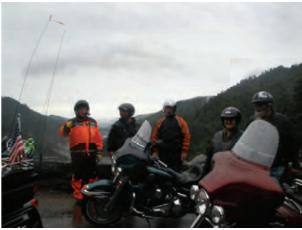
Rain Gear Needed – 9/26/10