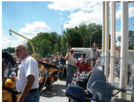
Riding the Ferry – Baraboo – 6/19/10