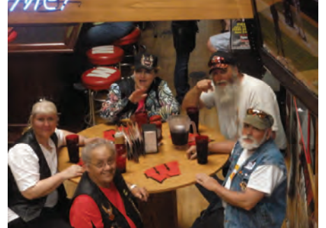
Monk's – The Dells – 6/19/10