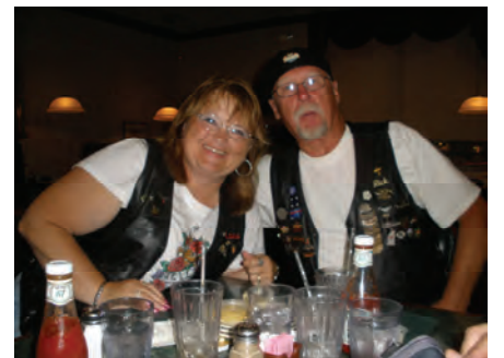
Dinner at Meyer's – 7/23/10