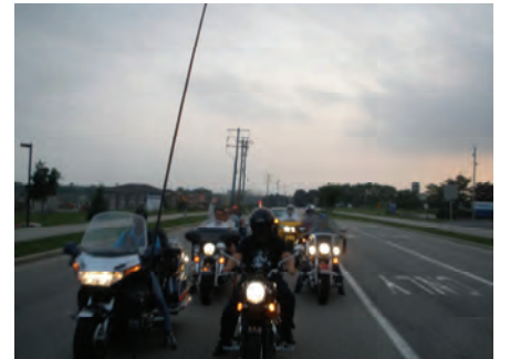
Dinner Ride – Sullivan Inn – 8/21/10