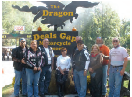
End of the Dragon – 9/28/10