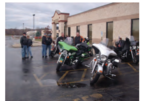
Last Ride of the Season – 10/23/10