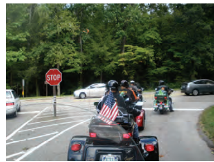
Vacation Ride – 2010