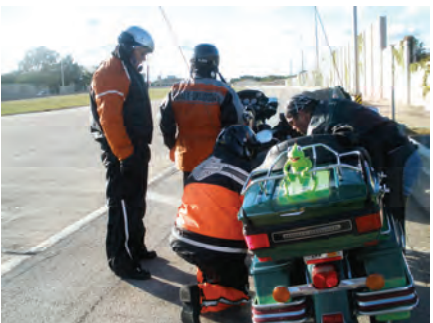
On The Road Repair – 10/2/10