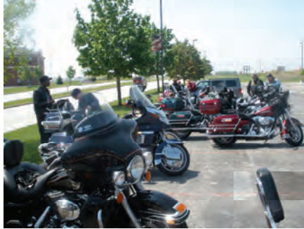
On The Way to Maritime Museum-Manitowoc-5/22/10