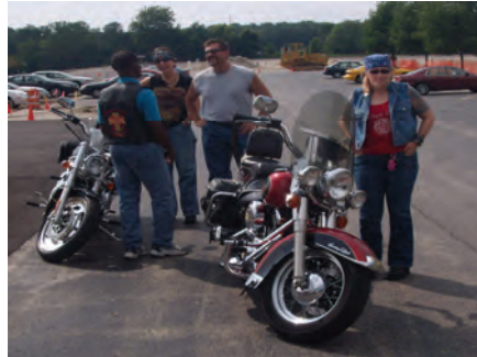
Dinner Ride – Sullivan Inn – 8/21/10