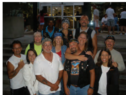
Custard Anyone? –