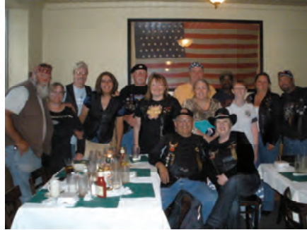
Dinner Ride – Chance's – Rochester – 6/4/10