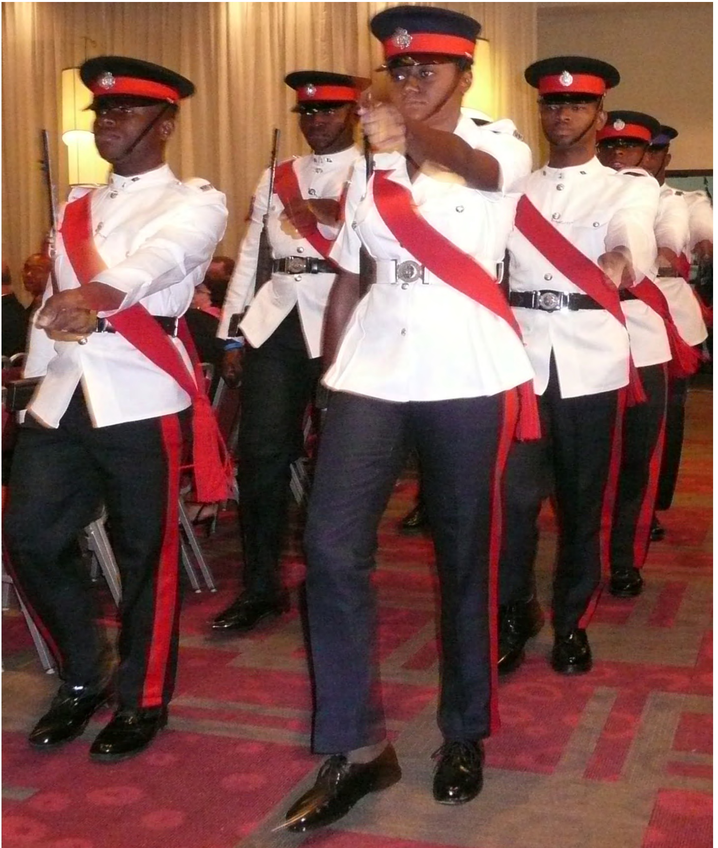
Jamaican Constabulary Force Honor Guard marching with extreme precision during the Memorial Service at the 38th Annual Training Seminar at Rose Hall Resort in Montego Bay, Jamaica.