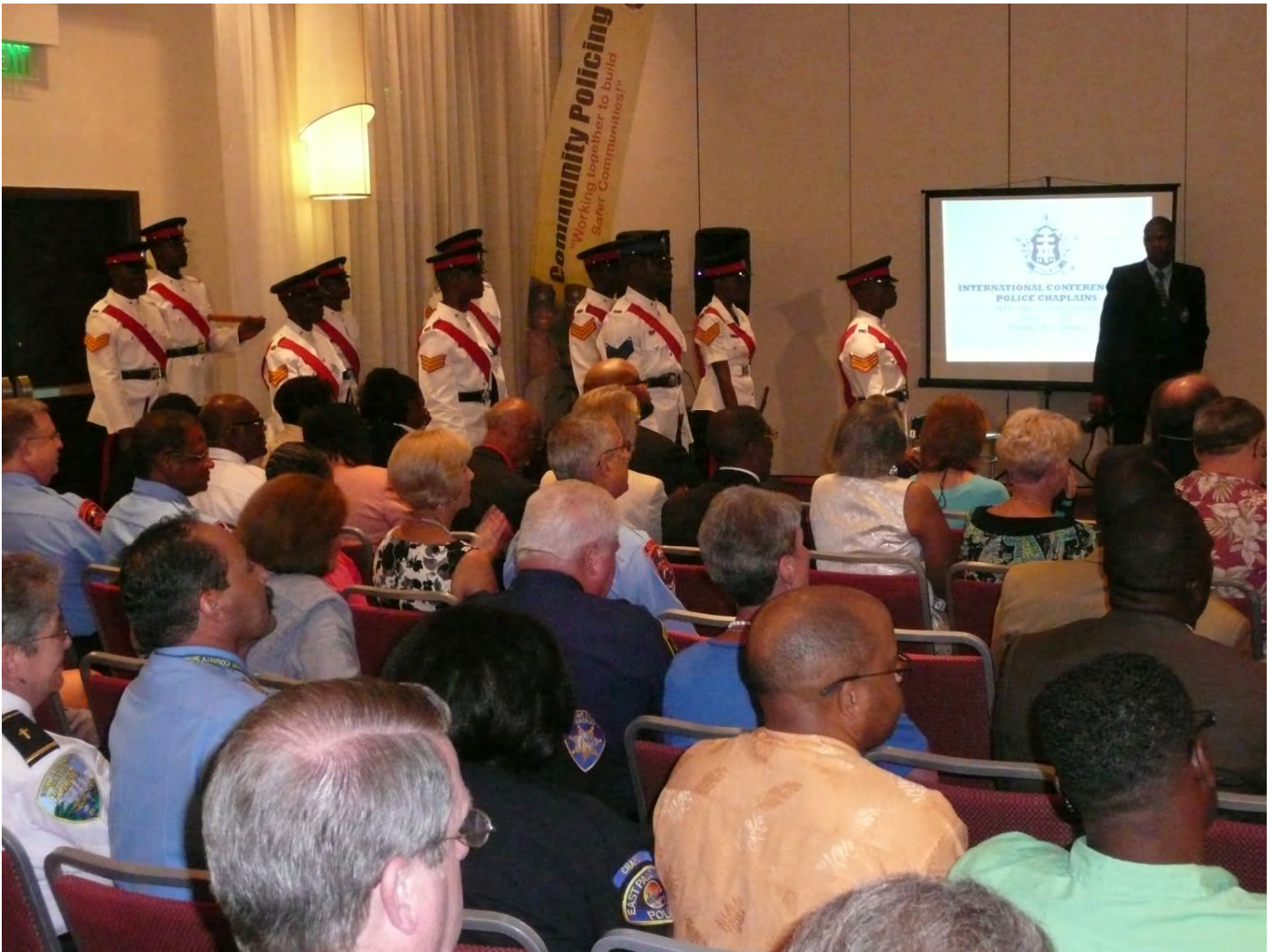
The Jamaica Constabulary Force Honor Guard marches in the formal opening ceremony of the 38th Annual Training Seminar at the Rose Hall Resort in Montego Bay, Jamaica.