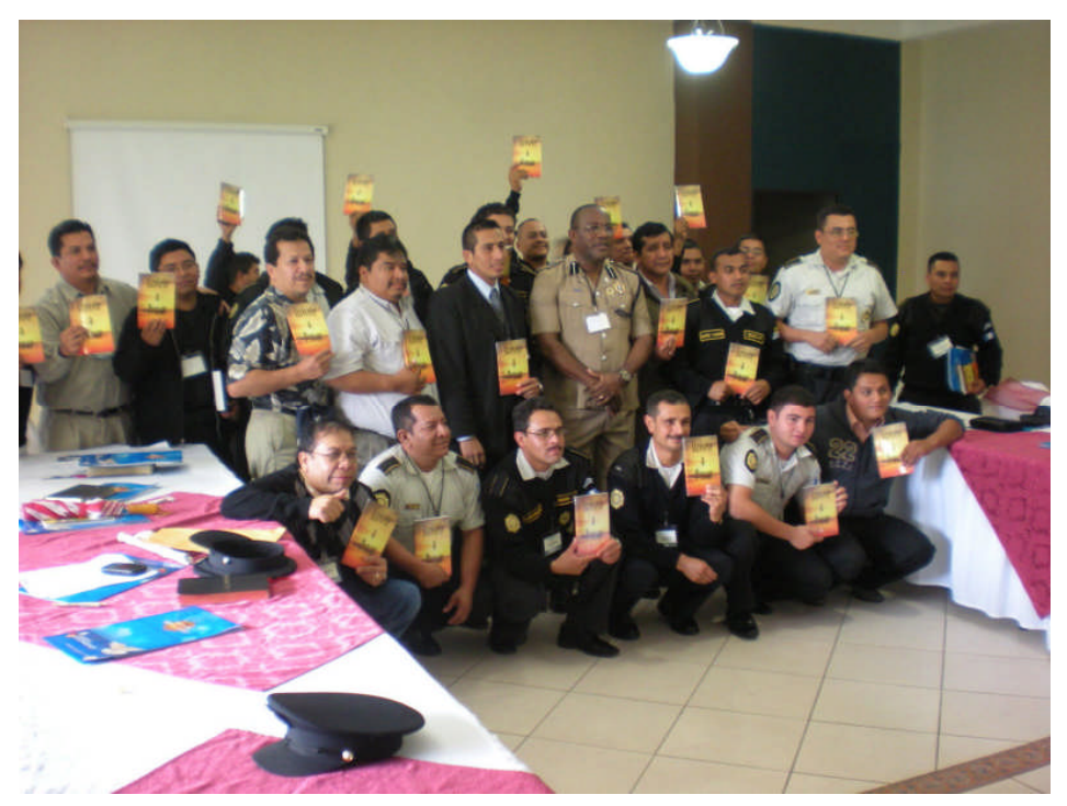
Chaplain/Officer and Chaplain/Pastor Trainees proudly display their ICPC Training Name Tags.

Our team arrived on October 15<sup>th</sup>, spent a day in final preparation and then embarked on teaching the