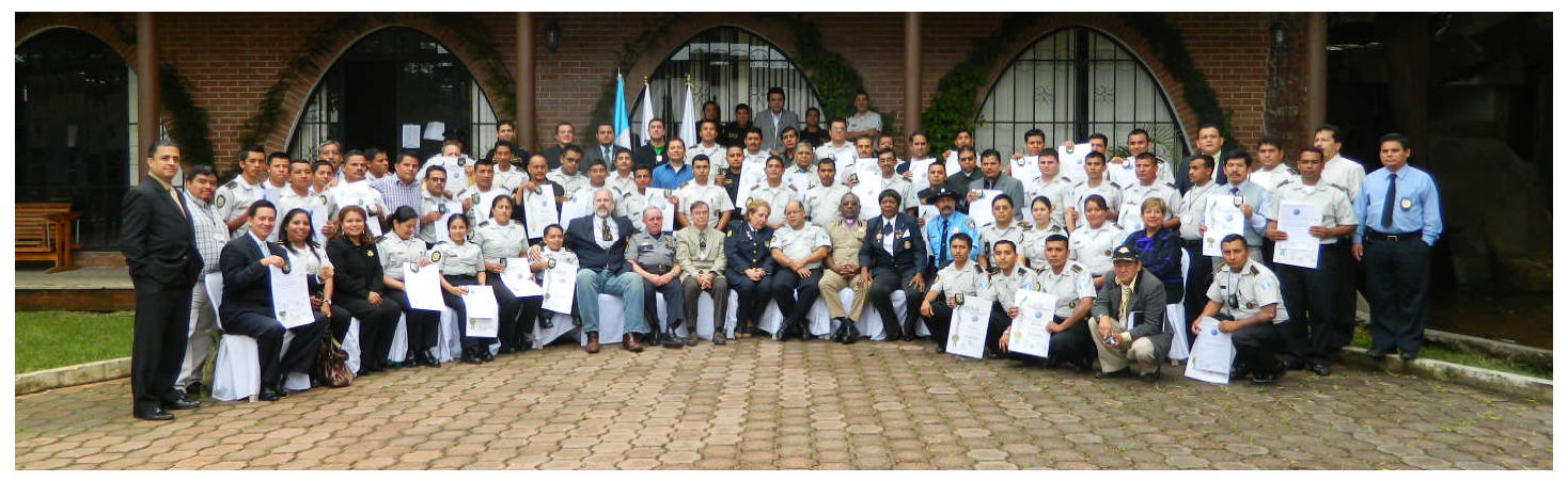
The Chaplain Trainees pose for a group picture after successful ICPC training.

I will tell that these tears are driven from the emotions of those who have Continued on Page 6