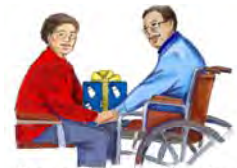
Remember our Shut-ins

Please call the office if you need any addresses. Thank you.