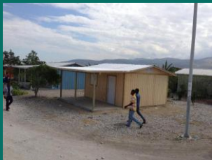
One of the houses that the team was working on, that is almost done.