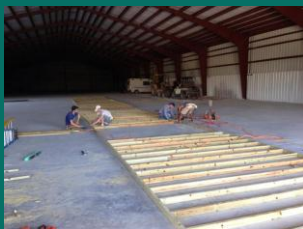
Some of the team working