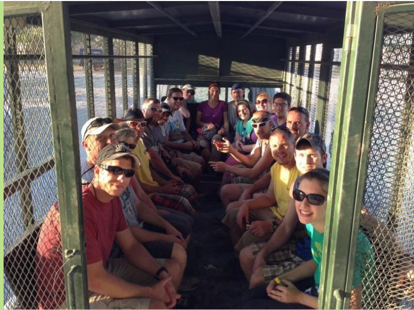
The Haiti Team taking a tour of the Love A Child compound and learning about their ministry.