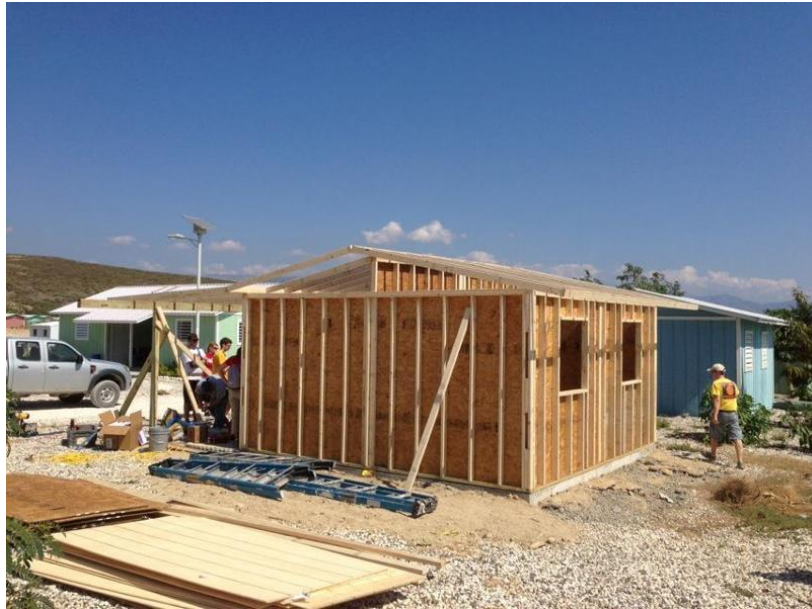
One of the three houses that the team worked on putting together, on Tuesday.