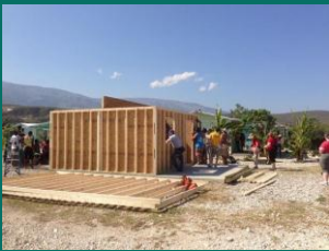
The team standing the walls for one of the three houses that they are building while in Haiti.