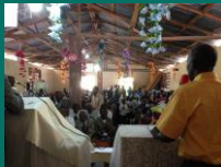
The church service in Lastik