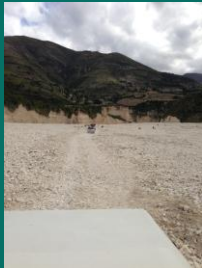
Driving up a dry river bed to the mountain village of Lastik