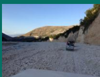
Driving back down the mountain from the church in Lastik