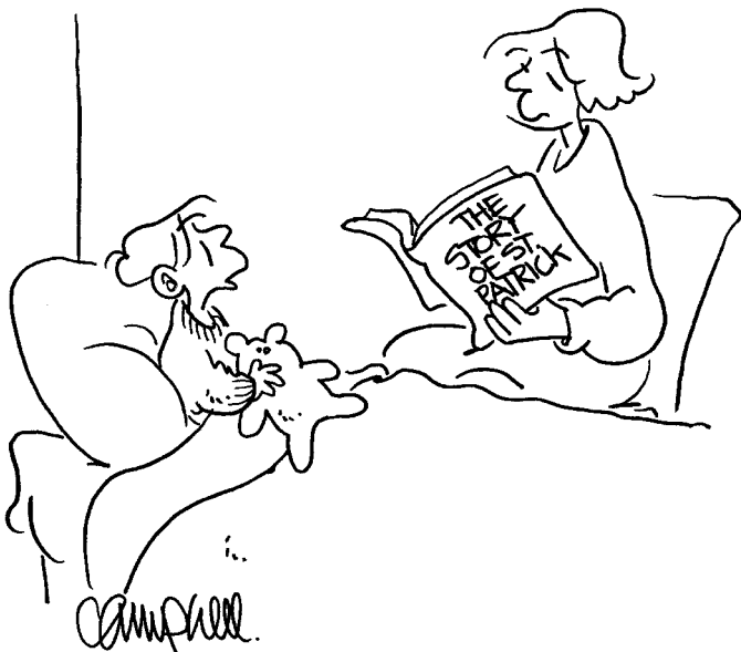
"What did St. Patrick have against snakes?"

As great as Easter is, it's only the "first fruits" of what lies ahead. Celebrate the fact that Christ is risen, but remember that the best is yet to come!