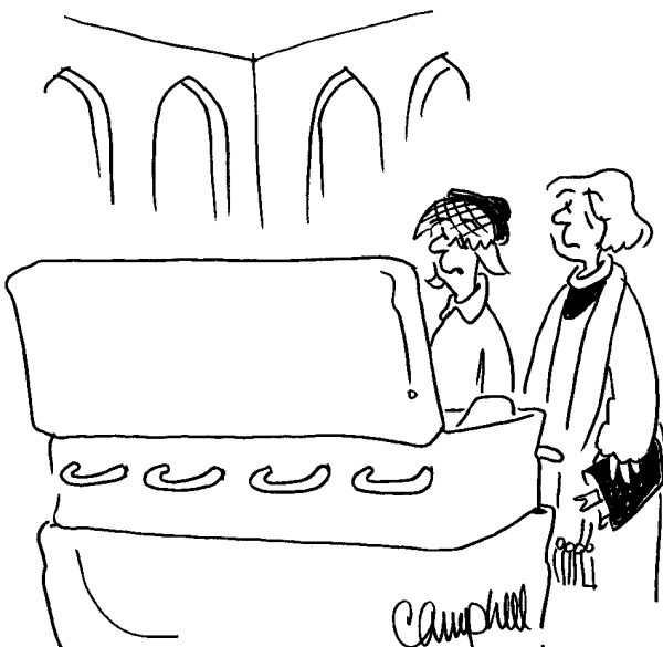
“That’s the remote control he’s holding. He could never rest in peace without it.”

Q: What time of day was Adam created? A: A little before Eve.