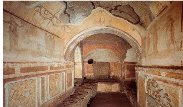
Catacombs of Priscilla in Rome

For more information or to indicate interest in one of our upcoming groups contact kristine@fpcnorfolk.org .