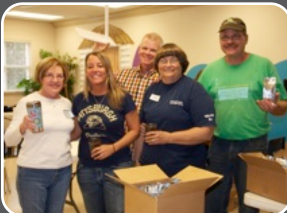
Our church partners from all over the Orlando area joined us to package 4600 bags of coffee. Thanks to all our friends for their great help!

Young Life purchased 4000 four ounce bags of our coffee to give out to each of the 4000 conference participants. Imagine that! We also sold 600 one-pound bags at the Celebration World Market. And recently we learned that the Young Life Service Center will be serving our coffee to the Service Center employees and guests. Young Life areas are using Beyond Beans Coffee mission-wide as fundraisers for U.S. camping. Check out the new web page at beyondbeanscoffee.com .