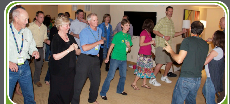
The International South team met for a salsa lesson.