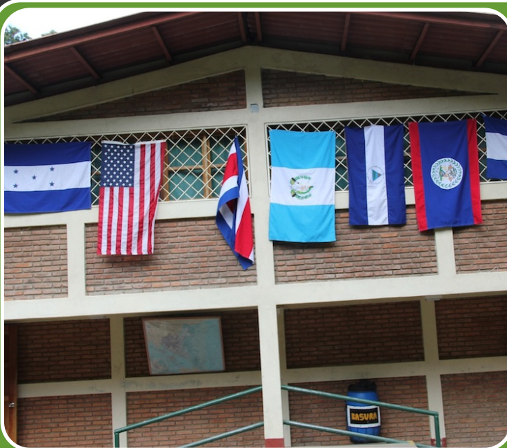
We hung the flags of each country represented at the training camp on the front of the auditorium.

Vida Joven Nicaragua has over 20 leaders with between five and eight years of experience as volunteers. This is a deep leadership bench indeed. These capable men and women are ready to be hired full-time. Might you consider supporting them and help us bring them on as full-time leaders?