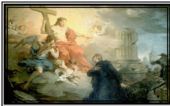
The Vision of Saint Ignatius of Loyola Pierre Hubert Subleyras (1745)