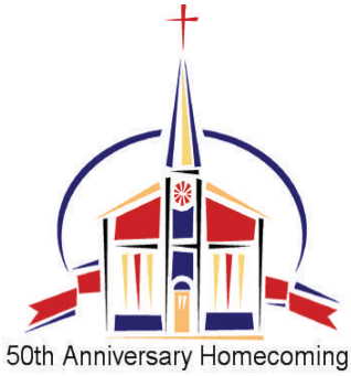
50th Anniversary Homecoming

April 25-26, 2009 CHURCHWIDE WORKDAYS – All members are asked to help get ready for our 50 th Anniversary Celebration by working on select Saturday workdays and any weekday from 9 – 3 PM to clean up our sanctuary, classrooms, MAC, kitchen, and grounds. Watch bulletins for more information on dates.